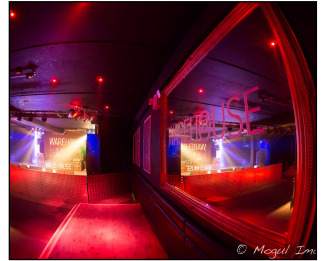
Get the party started: commercial brochure work