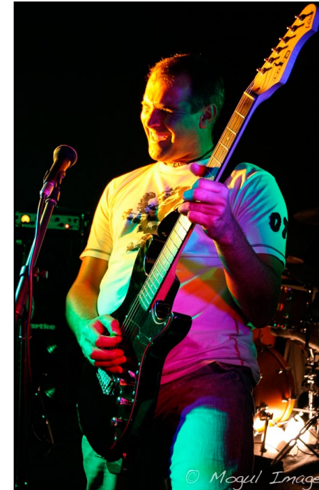
Colourful: rock concert