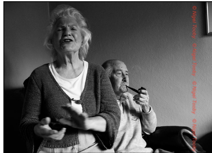
Family life under scrutiny: a project called Mifamilia