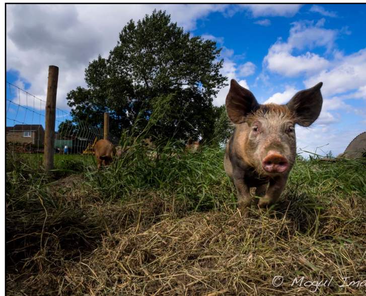
What a babe: from a commercial brochure