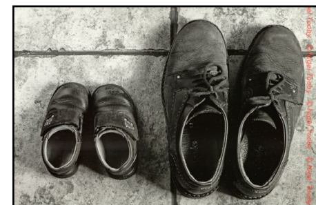
Mifamilia: Father and son's shoes